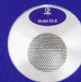
SD-B Metal Sub Station (Standard for DL+ Master)