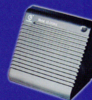
SD-2006HL+ Sub Station